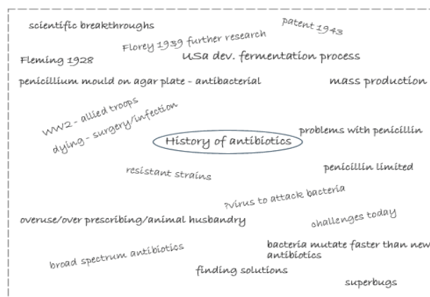
Figure 1. An initial brainstorm

Write your topic on a piece of paper. Quickly write down anything that comes to mind – work freely. Write key words (see Figure 1). There is no need to categorise your information at this stage. Keep writing until you can't think of anything new.